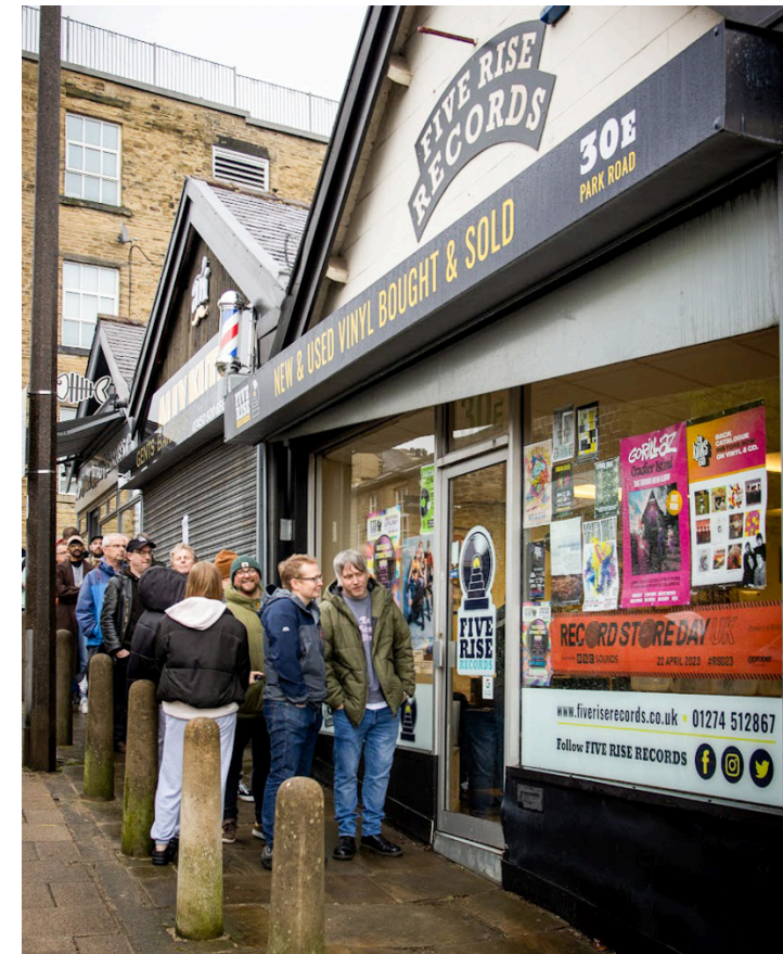
Early morning queue outside on RSD, April 2023