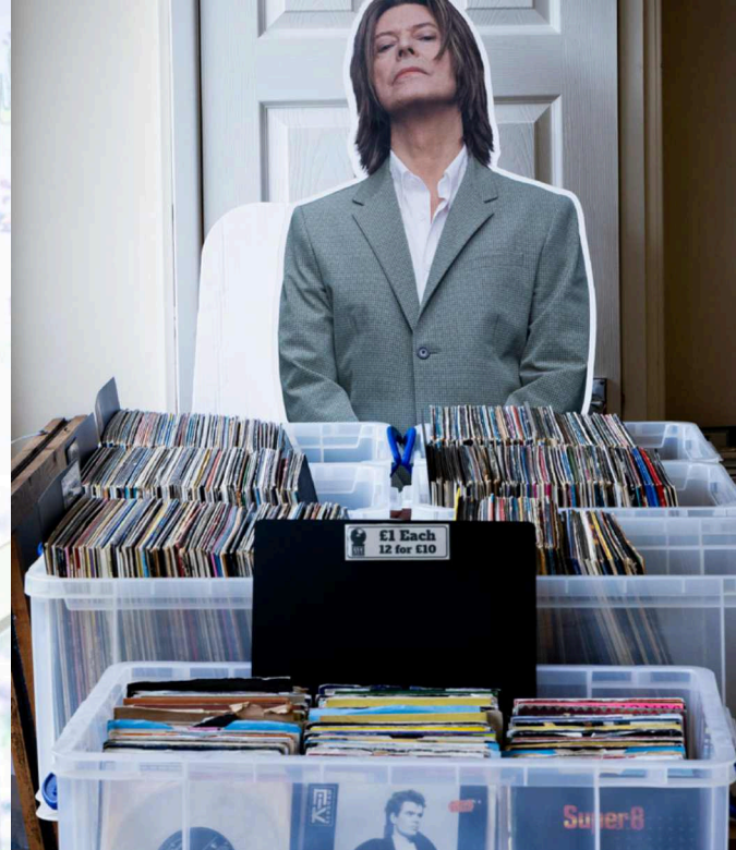
Bowie watching over the racks, trying not to pass judgement on Nik Kershaw fans...